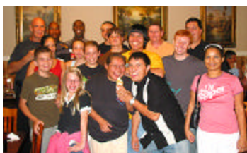
At dinner after the tournament ...